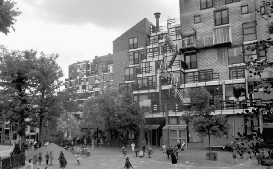
Figure 16.2 Student residence, L'Université Catholique de Louvain, Brussels

paternalistic order” of the pre-existing institution and its architecture with his team’s approach that moved toward “diversity, everyday culture, decolonization, the subjective, toward an image compatible with the idea of self-management, an urban texture with all its contradictions, its chance events, and its integration of activities” 56 (see Figure 16.3). He claims that this approach is political rather than aesthetic, and compares his work with the complexity of ecological systems. 57 While Lefebvre criticizes the focus on “things in space” (commodities) rather than a broader understanding of production of space, 58 Kroll suggests that his practice has “moved far from the traditional role of the architect as maker of isolated objects.” Instead, Kroll’s emphasis is on the “relationships between people in space that suits them . . . Construction finds its meaning only in the social relations that it supports.” 59