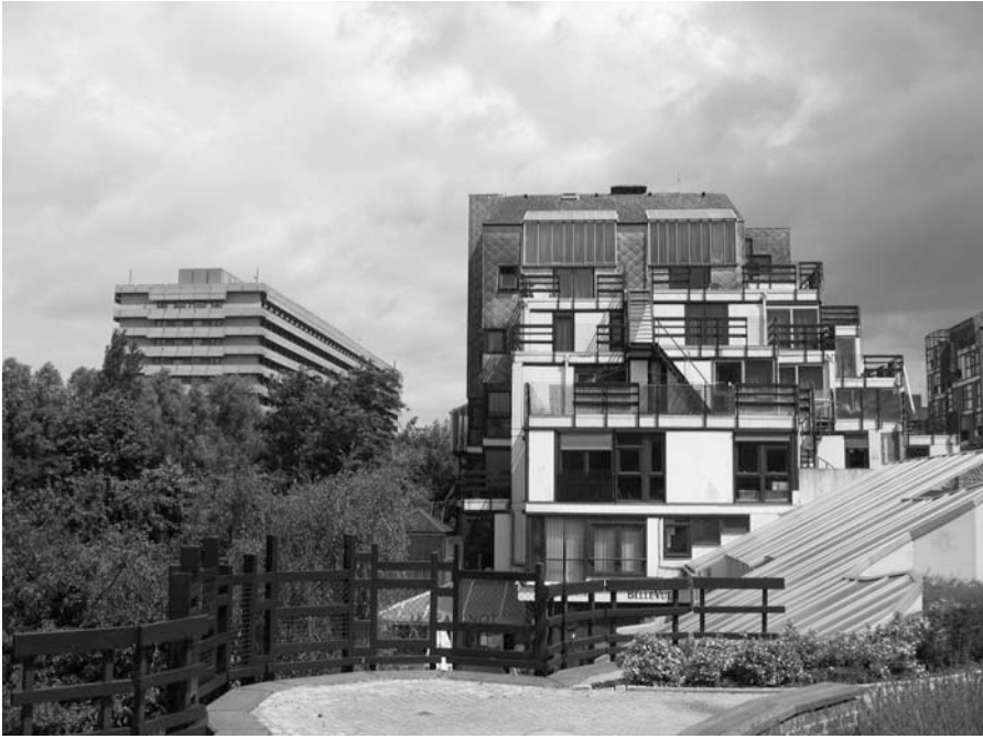
Figure 16.3 Kroll's work contrasted with other campus architecture of the period

an example. 60 He states: “The notion was that . . . ‘users’ and ‘inhabitants,’ as a group, would secure the services of someone competent, capable of speaking and communicating—in short an advocate—who would negotiate for them with political or financial institutions.” 61 In Lefebvre’s thinking, these attempts to speak for the users were bound to fail “because no one has the right to speak for those directly concerned here. The entitlement to do so, the concepts to do so, the language to do so are simply lacking. How would the discourse of such an expert differ from that of the architects, ‘developers’ or politicians?” 62 Although these practitioners were well intentioned, their efforts ultimately fell short because they did not give voice to the silent users, choosing instead to speak for them, interpreting their needs. 63